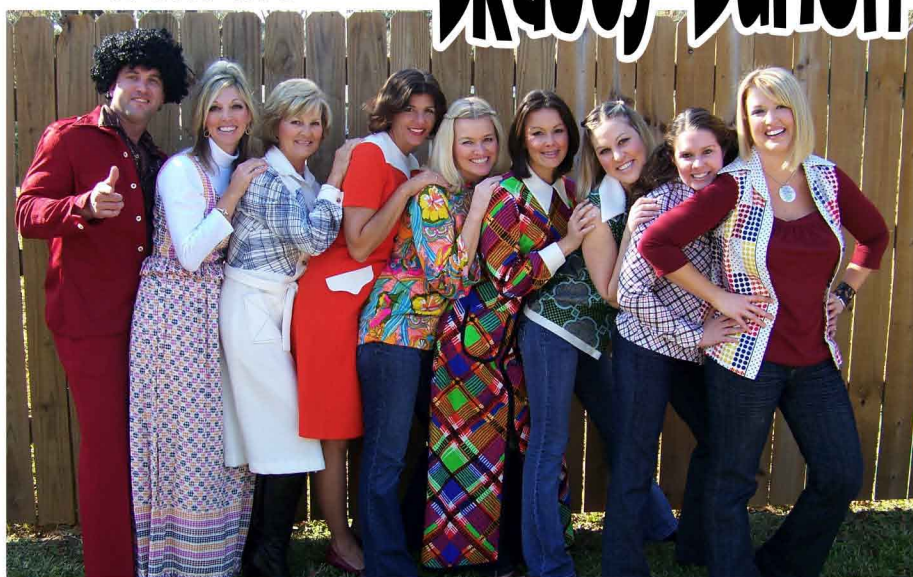
2008 Christmas Card